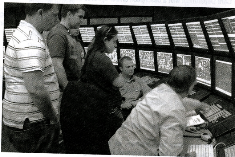
Students completing ACC's Process Technology program have a great advantage in obtaining a job within the local petrochemical industries.