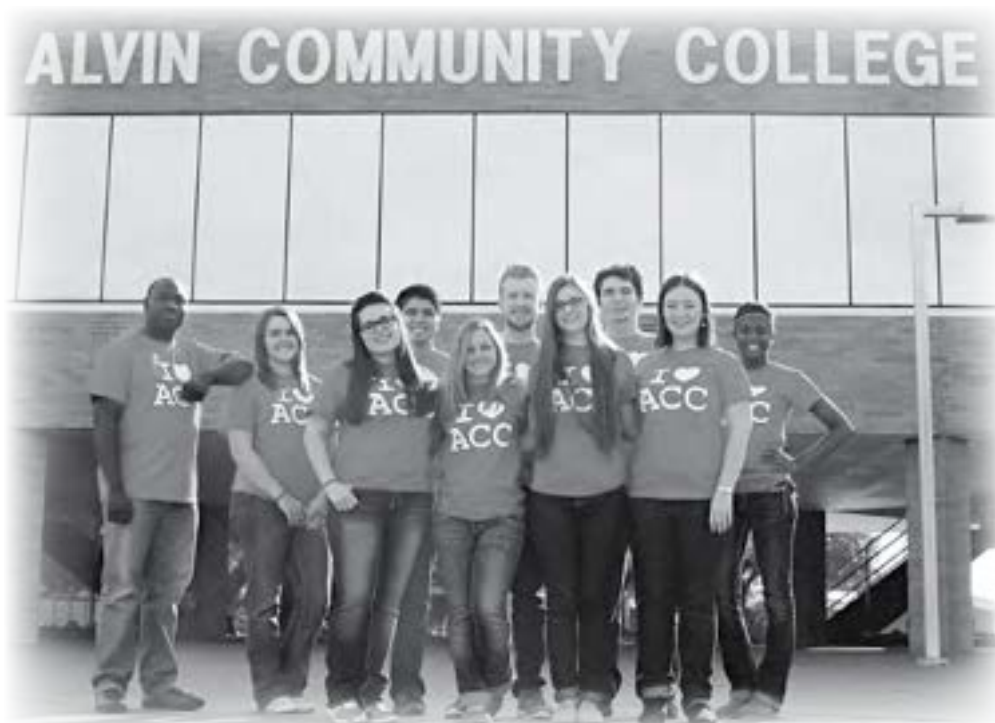
Spring 2015 Student Ambassadors

Students who register for an online section of any course must first register for ORNT 0100 before registering for an online course.