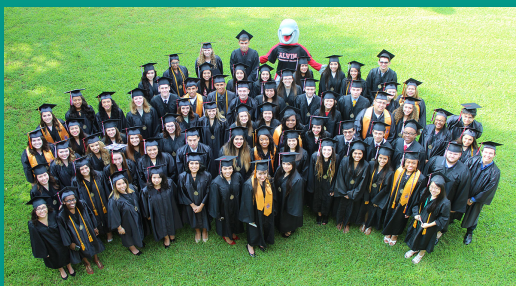
2016 Dual Credit Graduates

"Dual credit is an affordable way to earn college credit while still in high school. I am very pleased with the affordability of the program. My daughter graduated with a year worth of college credit for a little over $1,000 compared to the $20,000 a year she'll pay at the university."