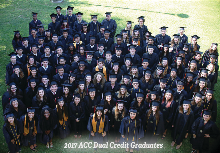
2017 ACC Dual Credit Graduates

"Dual credit is an affordable way to earn college credit while still in high school. I am very pleased with the affordability of the program. My daughter graduated with a year worth of college credit for a little over $1,000 compared to the $20,000 a year she'll pay at the university."